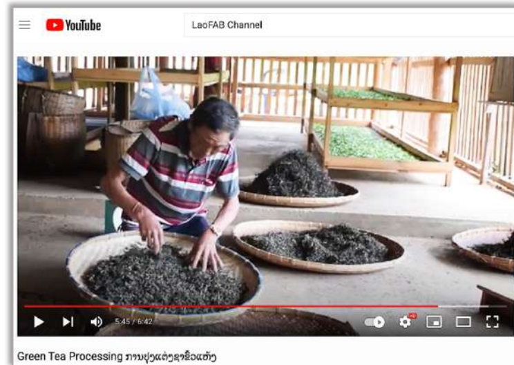
Extension materials based on farmer experience

Green extension alone is not sufficient to promote sustainable agriculture. Formal research and development efforts are needed that help reduce the costs and increase the financial benefits of organic and clean farming practices, including measures related to value