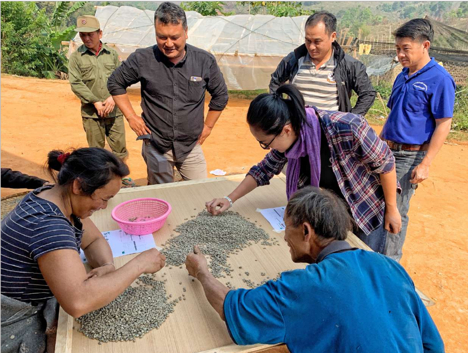
Partnering with private sector to move farmers up the value chain

strategy, thereby increasing rural environment that were associated with the first wave of cash crops in the country. By engaging farmers in testing and adapting innovations under local conditions, the partners involved in implementing Green Extension have proved that it is possible to enhance the knowledge and income of farmers who adopt more sustainable practices through a combination of farmer-to-farmer learning, networking, use of print, television and social media. Green