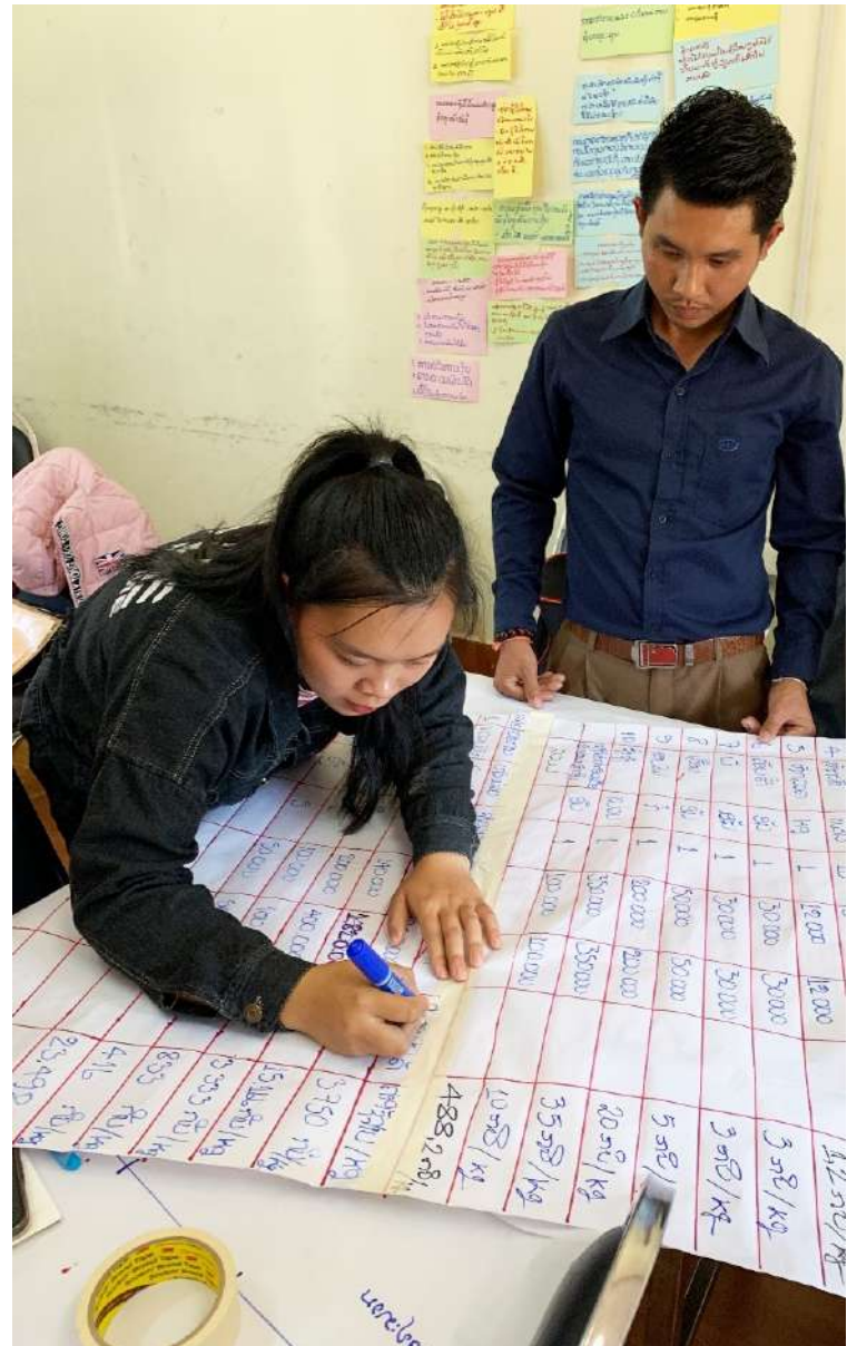
Rural youth prepare business plans.

Learning Multipliers: Multiplier activities take the lessons learned by farmers at the Learning Centres to a much wider audience. The means for doing this include farmer-to-farmer (F2F) exchanges, production and dissemination of extension materials, and the use of social media. (See the diagram below.) As a result of