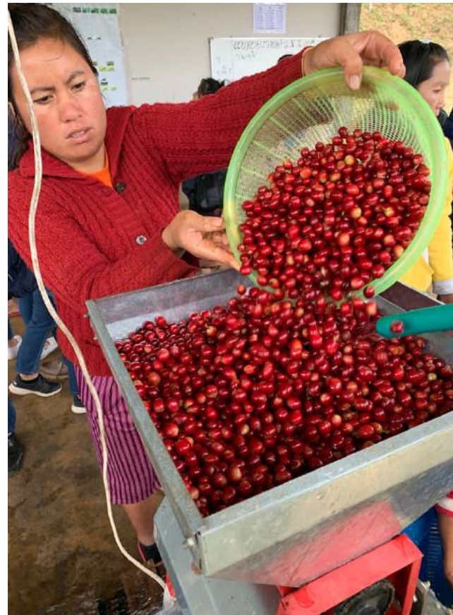
Coffee farmers test new processing techniques at GE Learning Centre.